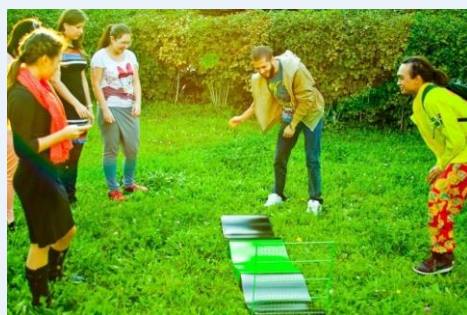
Fig. 2 Wave Track, a prototype game