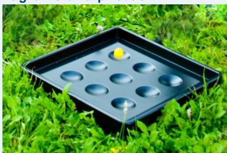
Fig. 1 CapBall, a prototype game